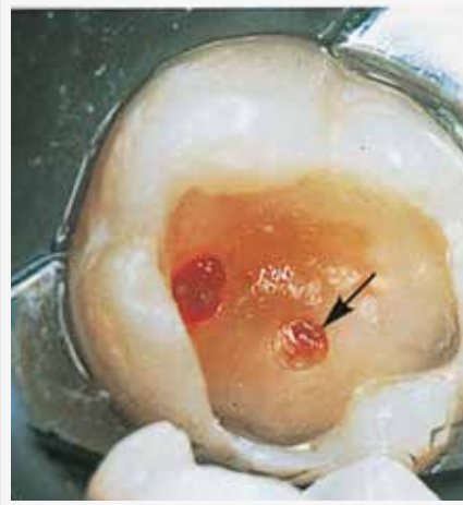
Two cavities after pulpotomy of two small lesions, showing haemostasis in the mesial, first prepared cavity (arrow) and cessation of bleeding in the distal cavity.

The radiograph of 35 with periapical osteitis.