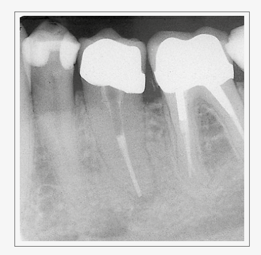
3 months later the periapical radiolucency has been replaced with new bone promoted by the Calasept.