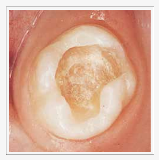
After 6 weeks the cement was removed, Calasept washed away and the excavation of the carious dentin completed without pulp exposure.