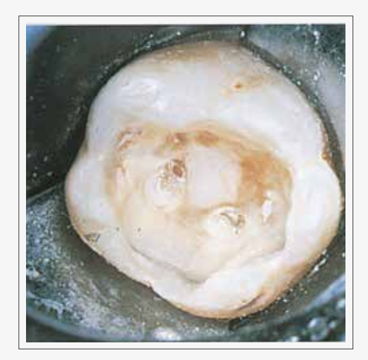
Appearance of hard-tissue barrier 3 months after pulpotomy.