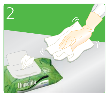
Apply the wipe to the area to be treated.