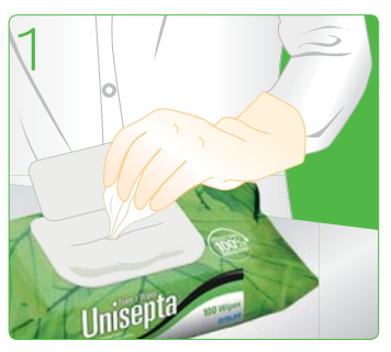
Remove the wipe from the pack.

Ensure that appropriate gloves are worn.