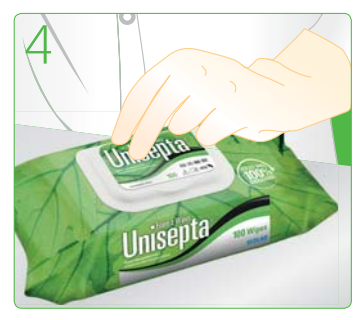
Ensure that the pack is closed securely after each use.