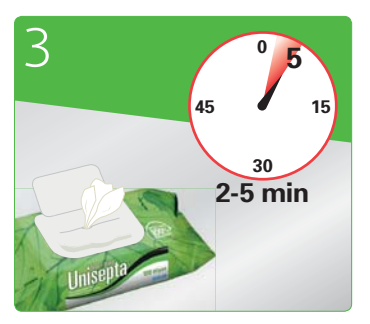
Respect the contact time indicated for the desired antimicrobial activity. Rinsing is not necessary unless the medical device comes into contact with skin or mucous membranes.