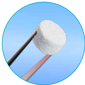
No soft-tissue harvesting

Geistlich Mucograft® Seal was designed with user-friendly handling in mind. The porcine collagen matrix can be sutured on top of the bone graft. This is easier and less time consuming than using conventional GBR with flap elevation and submerged healing and preserves the bone volume better than spontaneous healing.